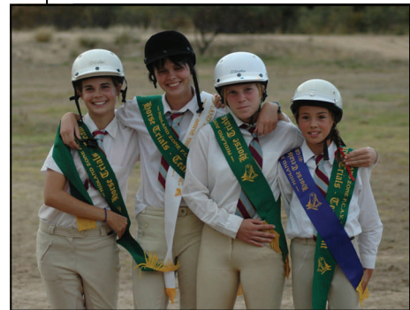
The Team who competed & supported